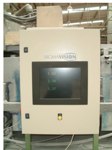
2) System controller and user interface